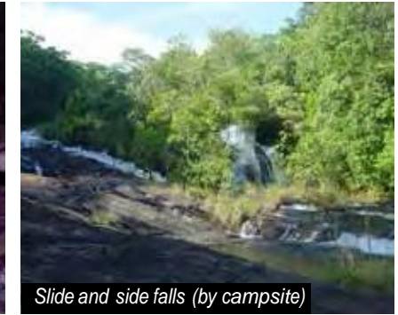
Slide and side falls (by campsite)