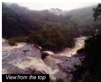
View from the top