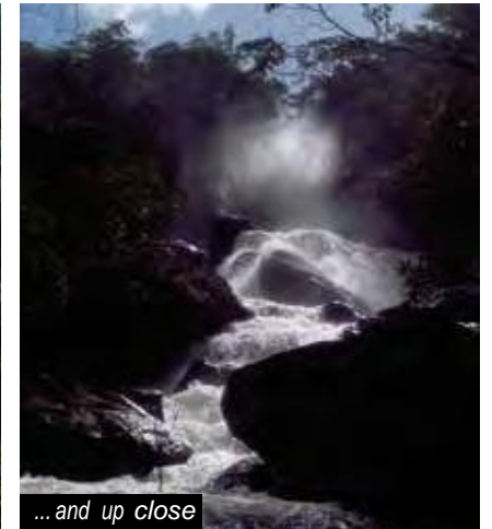
... and up close