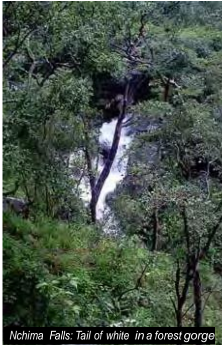
Nchima Falls: Tail of white in a forest gorge